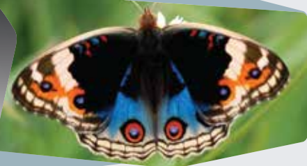
Blue Pansy Butterfly

The Wetland is not just a special place for birds, it is also a safe haven for Oman's plants, butterflies and other species.