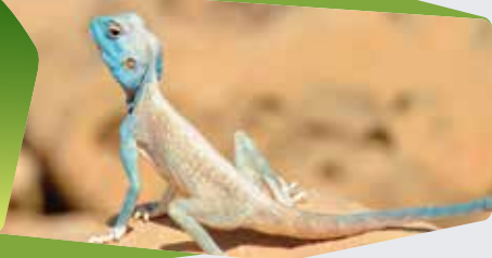
Blue Agama Lizard

Eagles arrive in November and may spend the winter in Muscat.