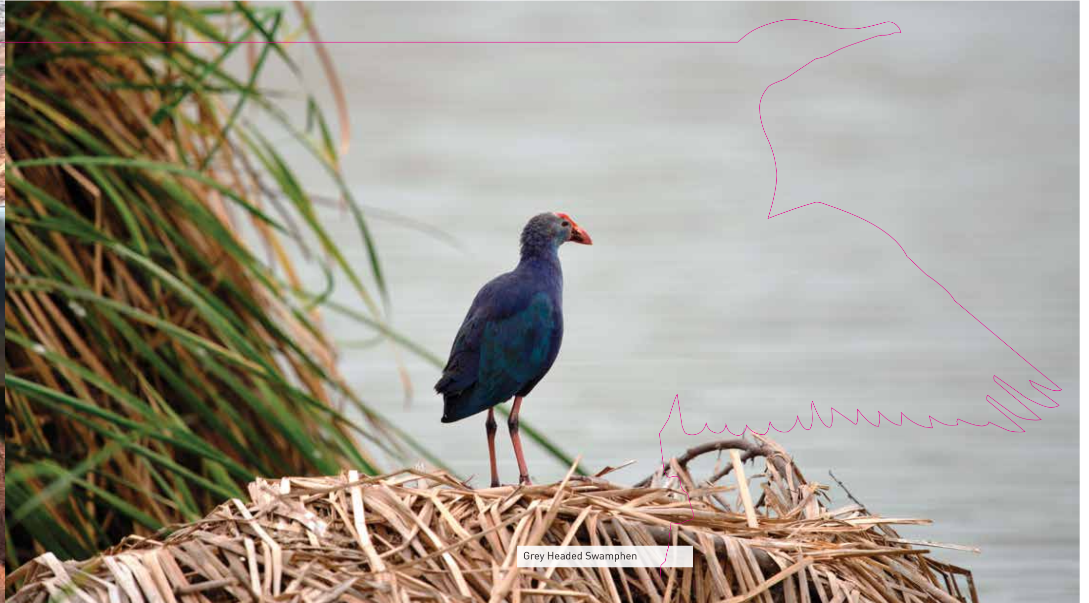
Grey Headed Swamphen