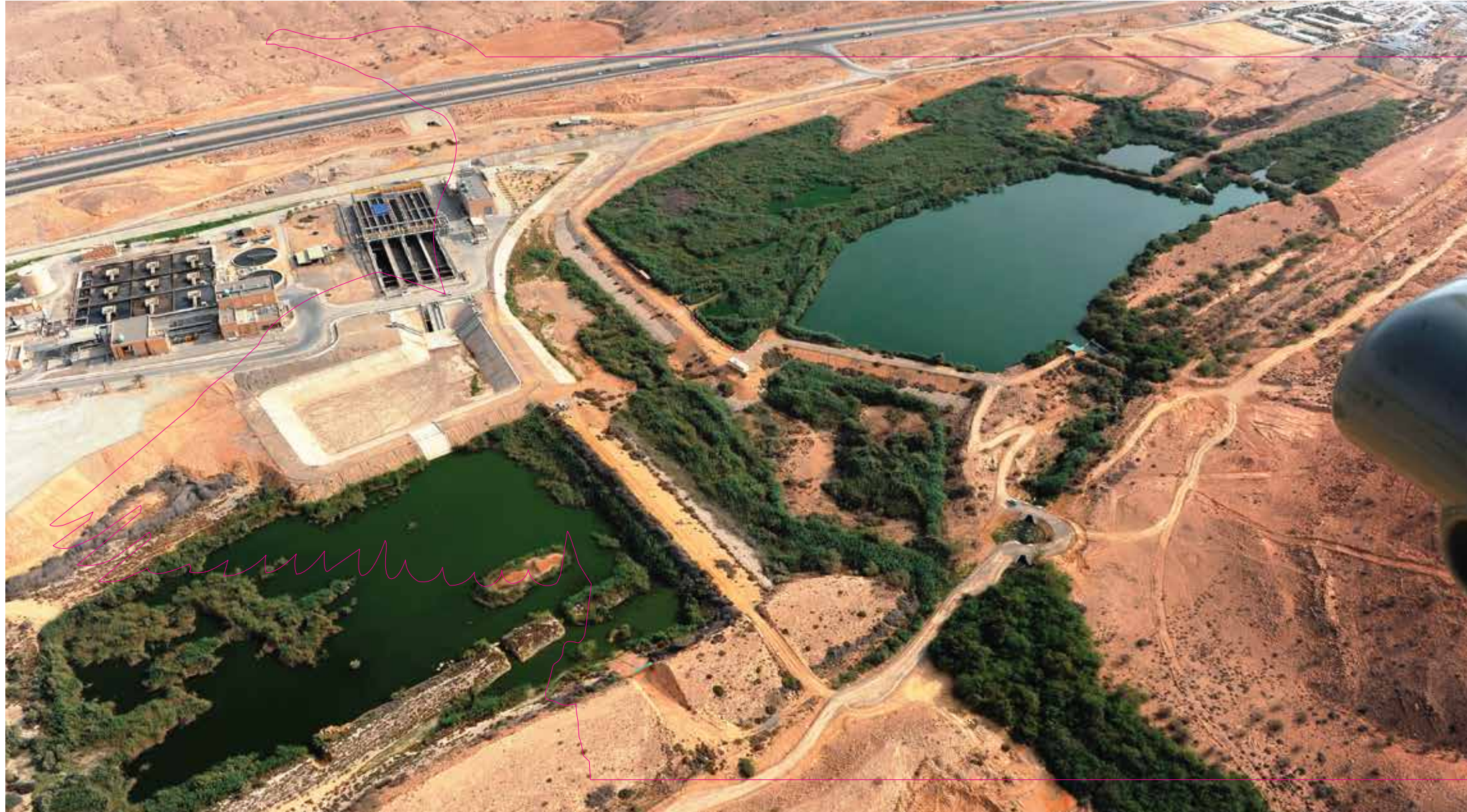
Inside Front Cover